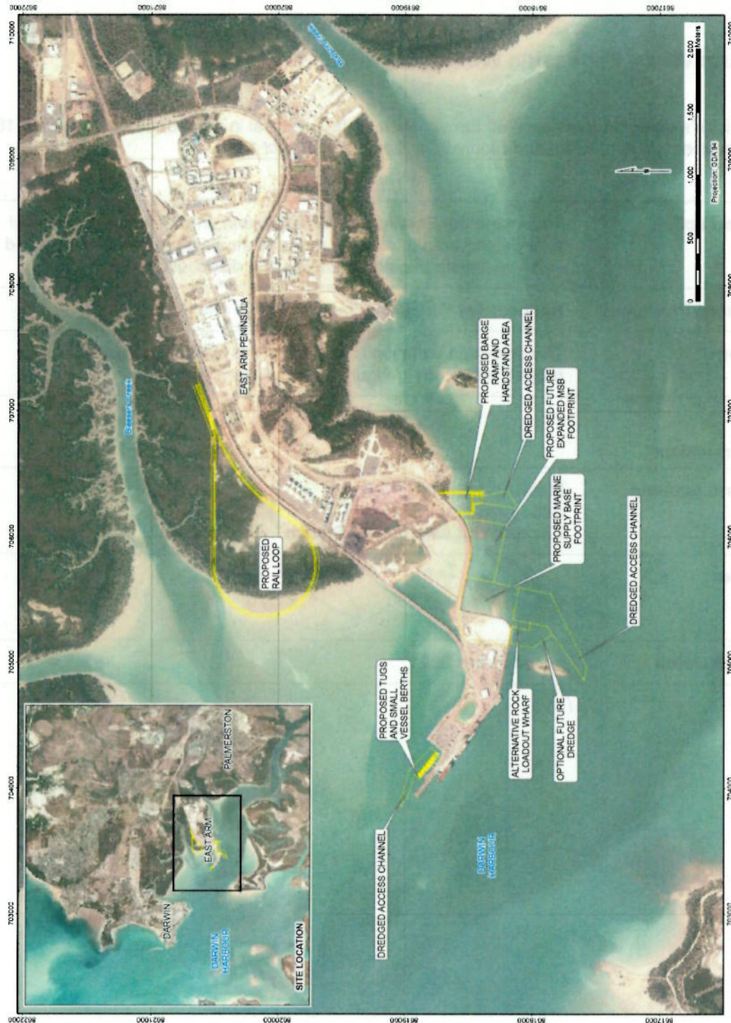
Figure 1 Project elements as part of the proposal