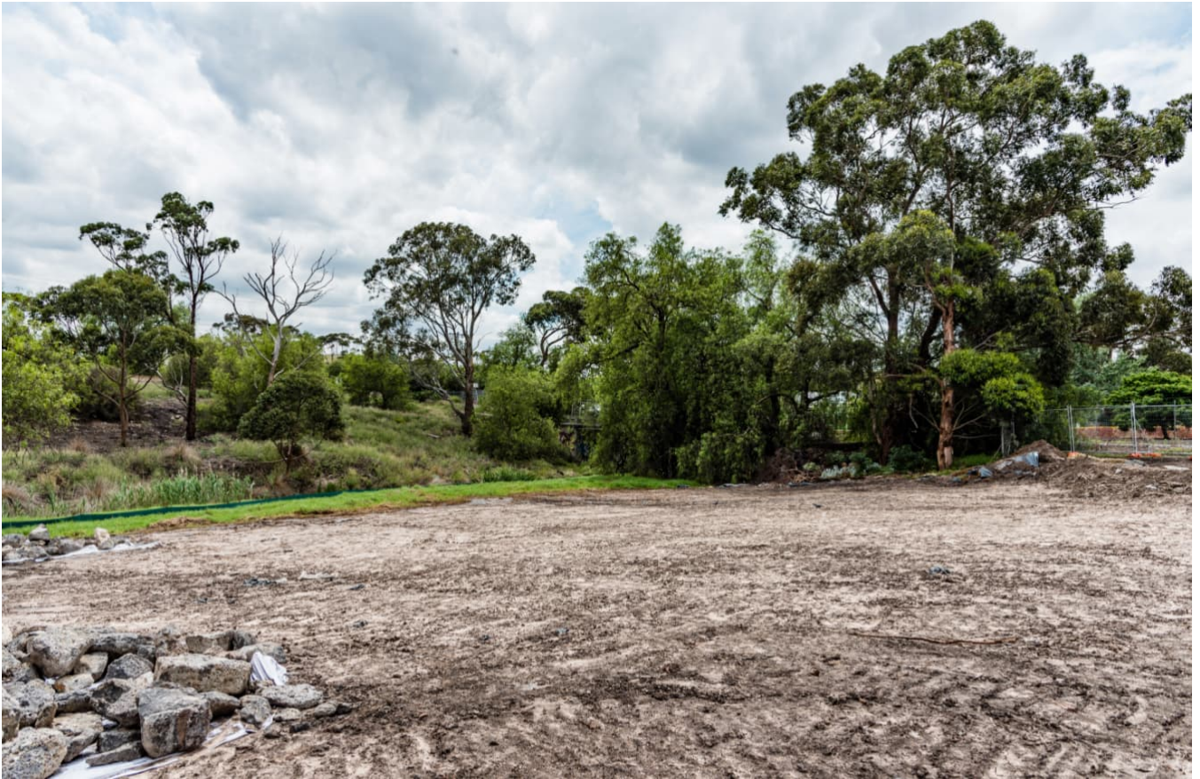
Figure 4 - Remediated area south and adjacent to Kororoit Creek looking to the east