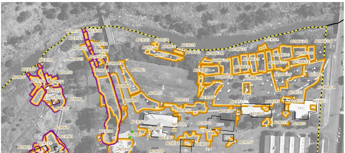
Figure 3 - location of excavation areas