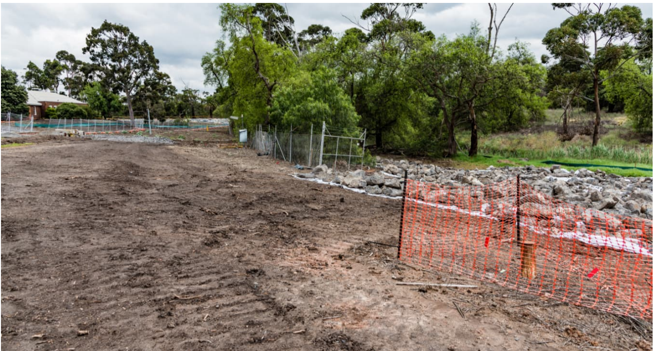
Figure 5 - Remediated area south and adjacent to Kororoit Creek looking to the west