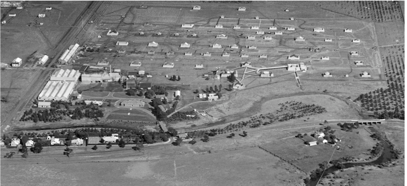
Figure 1 - Image of the site looking south (circa 1930s) with Kororoit Creek in the foreground