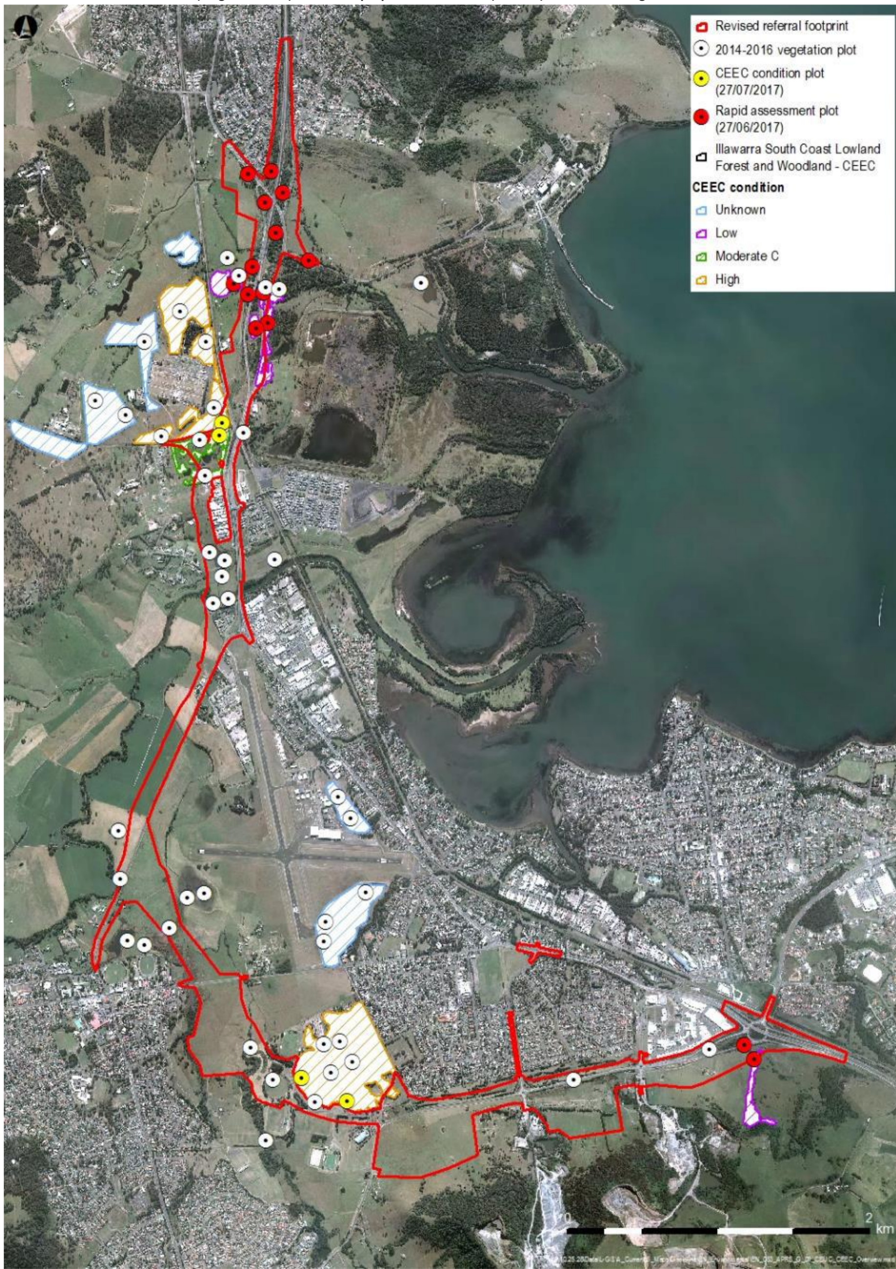
Annexure B: The extent of ILFW (diagonal hatch) within the proposed action area (red line) and surrounding areas