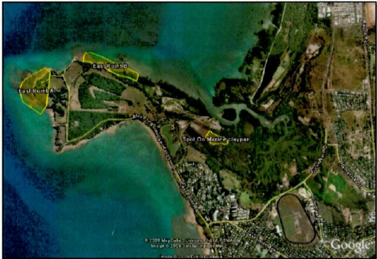
Known migratory shorebird roosting areas in the vicinity of East Point, outlined in yellow. (Figure 4-5, the Supplement)