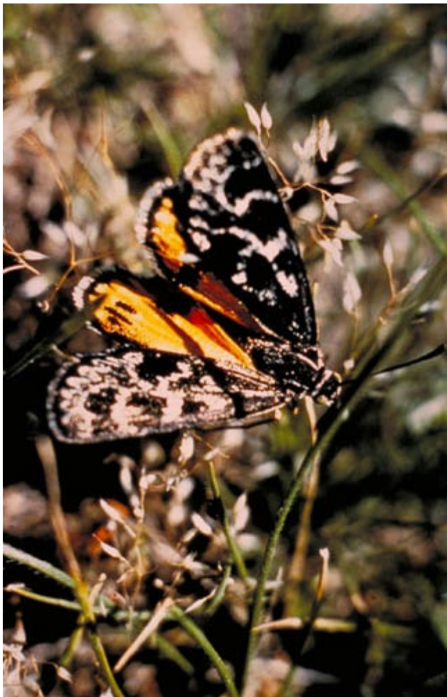
Female Golden Sun Moth

This document combines the approved conservation advice and listing assessment for the species. It provides a foundation for conservation action and further planning.