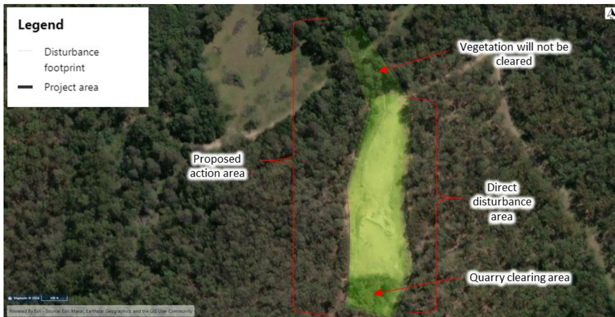
Figure 1. Proposed action area, showing existing cleared quarry footprint and 2,375 m 2 ha area of vegetation to be cleared in the southern end of the footprint.