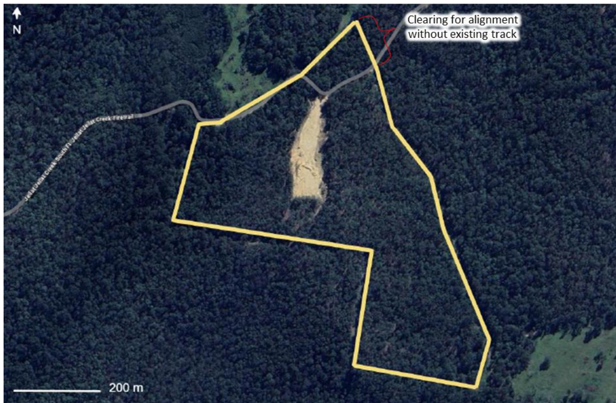
Figure 3 Proposed fence alignment showing approximate area where clearing has occurred along a stretch with no existing track (modified from Figure 3 of the Fence Assessment Report).