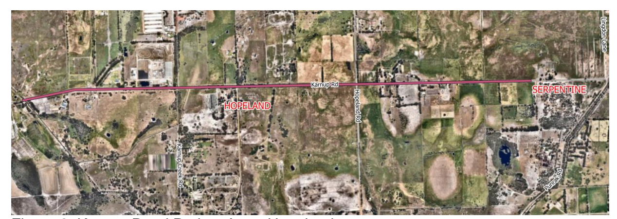
Figure 2. Karnup Road Project Area, Hopeland.

This Revegetation Plan will help to address the impacts of clearing roadside vegetation representative of the Southern River Complex and habitat suitable for Black Cockatoos. As outlined in the 'Application for a clearing permit', the purpose of the clearing permit is to undertake a road widening project to provide safer driving conditions in a recognised Black Spot area. Karnup Road is a Regional Distributer Road and a Shire of Serpentine Jarrahdale managed road asset. Figure 2 shows the 2 km extent of the road widening project along Karnup Road in Hopeland.