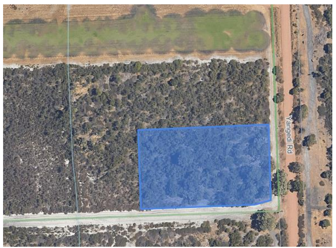
Figure 1. Yangedi Airfield Reserve showing 0.6 ha offset area in blue.

strategic objective of fulfilling representational targets for the long-term preservation of the vegetation complex. Specifically, the offset proposal will address several priority actions of the Marri Woodland Management Plan as outlined in Table 1.