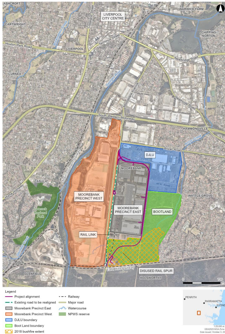
Map 2 – Commonwealth lands to be impacted.

As varied on the date this instrument was signed.